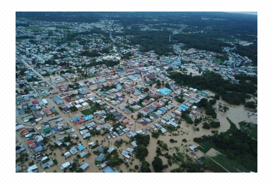
- Hurricanes in the Caribbean