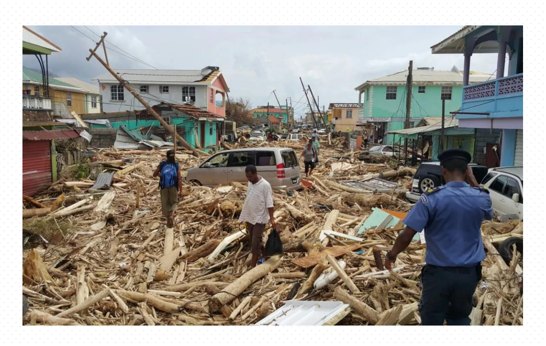
- The aftermath of Hurricane Maria, Dominica 2017