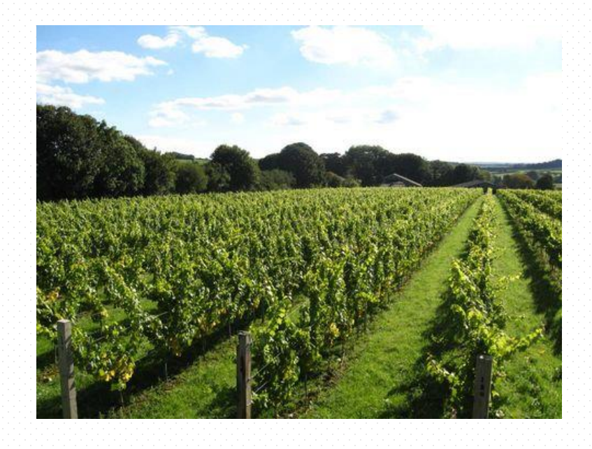
- Thriving vineyards in the UK